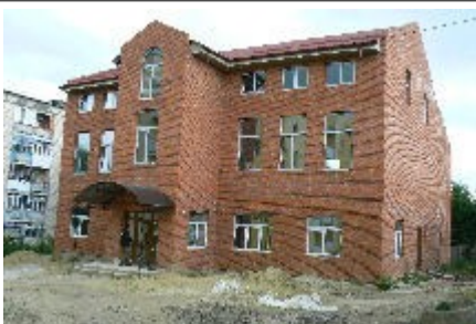
Nearby Zdolbuniv, daughter church