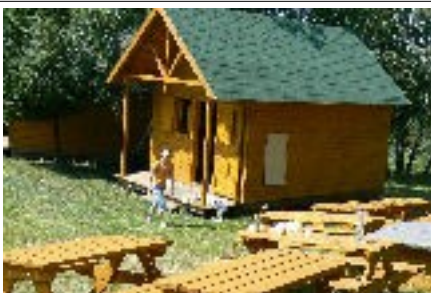
Cabin in Church Camp