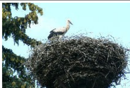
Stork's Nest near Hlinne