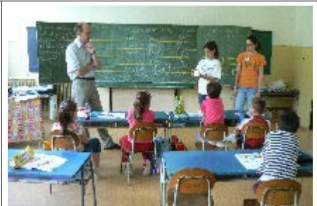
K-4 th Elementary School