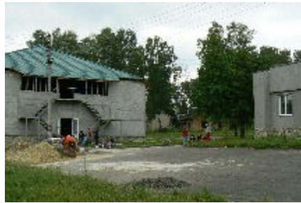
Church camp in woods