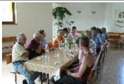
Lunch in Fellowship Hall