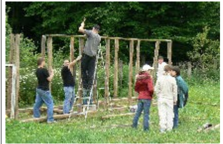
Building outdoor shower