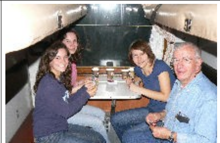
Card game on sleeper train