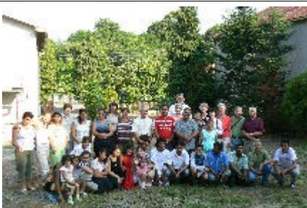
Roma and Workcamp in Hlinne